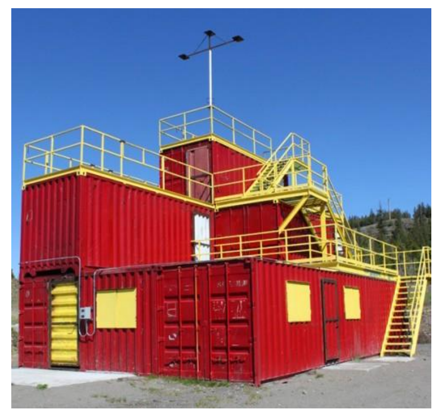
District of 100 Mile House Emergency Services Training Centre